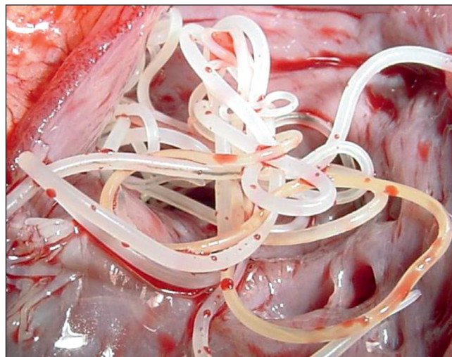
Figure 3 - Heartworms observed into the right cardiac chambers on necropsy.