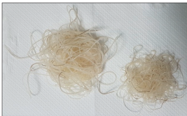
Figure 2 - Numerous adults of Dirofilaria immitis removed from an infected dog (females on the left side, males on the right).

tion and disease. This is why it is so important to administer preventives during the transmission season. In some areas of Europe, this means year-round treatment (see section “Prevention”).